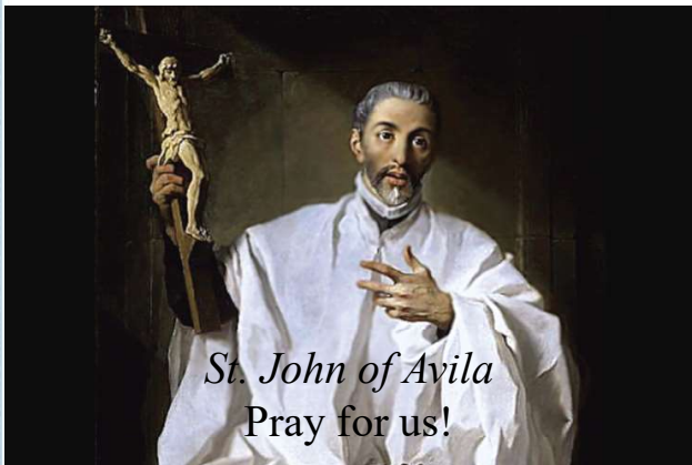
St. John of Avila Pray for us!