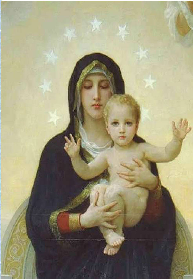
Common of the Blessed Virgin Mary Saturdays of Ordinary Time