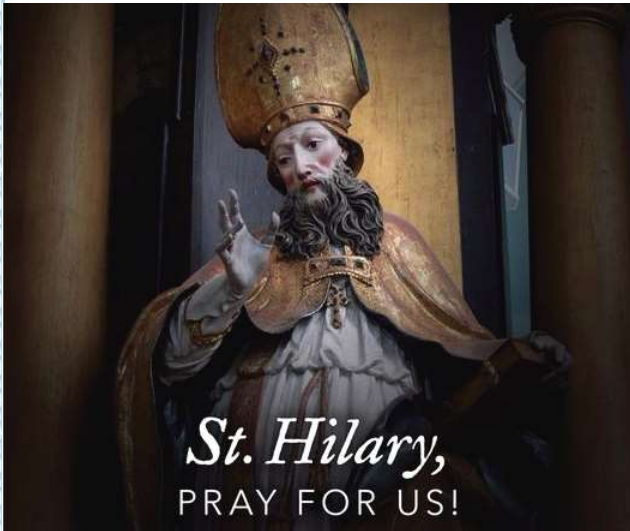
St. Hilary, PRAY FOR US!